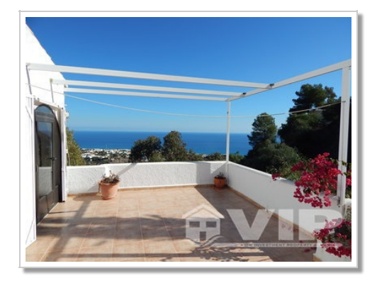
* Conveyancing not included.

The indicated price does not include the taxes and expenses derived from the sale (ITP at the current tax rate, notary, registration and legal fees). We remind you that as a consumer you have the right to be informed and given the corresponding informative documentation, depending on the case, based on the provisions of Decree 218/05 of 11 October which regulates the Regulations on Consumer Information in the sale of housing in Andalusia.